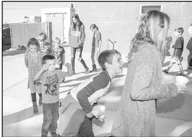
The new cakewalk attracts many players.